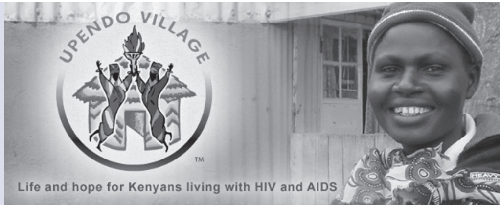
Life and hope for Kenyans living with HIV and AIDS